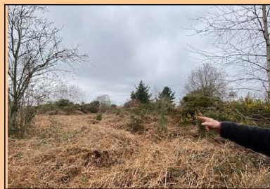
Always plenty to do!

bracken and regrowths of gorse need to be held back to give heather and grasses a chance. The BCS flail mower along with rakes and pitchforks gets the work done.