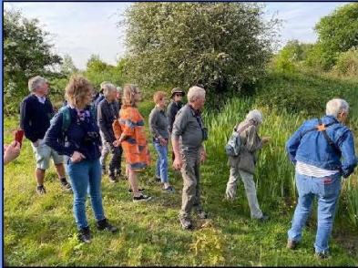
Bird walkers at Black Deek

We also visited land belonging to the Gowers on the other side of Bramfield Road. They are managing this land impressively for wild life especially for ground-nesting birds such as Yellowhammer.