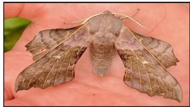
Poplar Hawkmoth at the Moth morning

For the second year, we ran a moth morning at St Peter's Churchyard in mid-August. A total of 67 species across the 4 locations were identified which compares with 68 at the same event last year although at slightly different locations in and around Wenhaston.